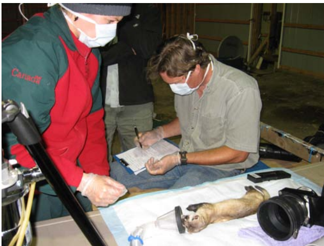
Black-footed Ferret being anesthetized and processed in Grasslands National Park

Following a successful release of 34 black-footed ferrets ( Mustela nigripes ) in October of 2009 (see December 2009 Newsletter), staff and volunteers at Grasslands National Park in southern Saskatchewan have been monitoring the success of this reintroduction effort. An additional 15 captive-born ferrets were released on September 23 rd , 2010 to supplement the existing population and further population recovery in Canada. This is the only population