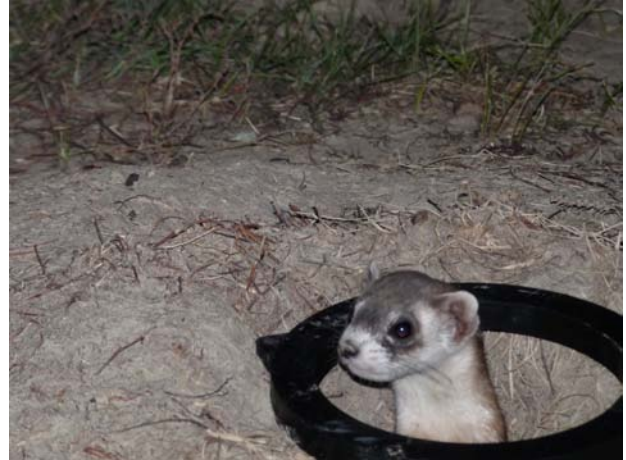
Black-footed Ferret Having microchip scanned in Grasslands National Park