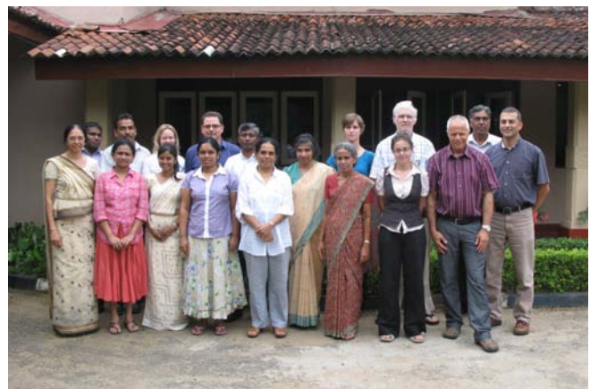
Sri Lankan and CCWHC representatives in Sri Lanka, July, 2010