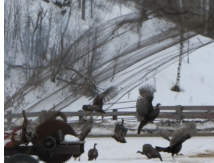
Pneumatic net launcher