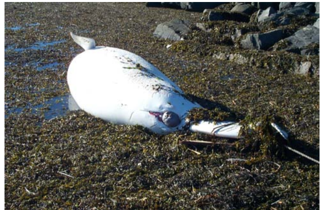
Carcass of a stranded beluga whale that died of dystocia. The grey head of the calf can be seen from the distended genital slit.