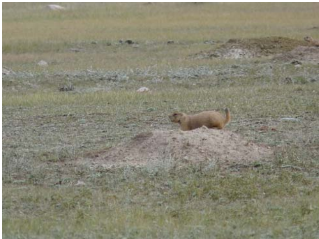
Black-tailed Prairie Dog

The finding of the Y. pestis in a prairie dog prompted the release of a local Information Bulletin on August 13 th , alerting local and regional media to the confirmed presence of sylvatic plague in the park. This also began an important and ongoing dialogue between provincial