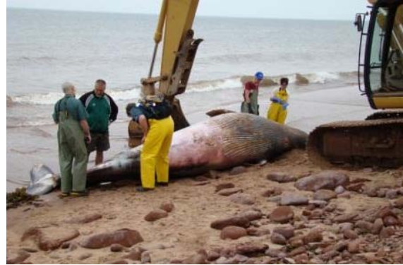
Minke Whale on the north shore of PEI, June, 2010