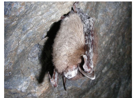
WNS infected bat in Eastern USA

Hibernating bats are most at risk to WNS disease. Bats that migrate (e.g. hoary bat) can travel hundreds and even thousands of kilometers, while hibernating bats do not tend to travel long distances between summer and winter roosts. There is a significant difference in bat diversity on the east and west side of the Rocky Mountains, suggesting this may be a partial barrier to bat movement. If bat-to-bat transfer remains the mode of spread for this fungus, and humans take precautions to not spread the fungus, the west could remain WNS free for many years. Preventing a giant leap of the P.d. fungus is the most important thing humans can do for western bats.