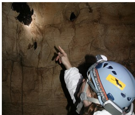
Bat ecologist counts bats

Preventing a giant leap of the P.d. fungus is the most important thing humans can do for western bats.