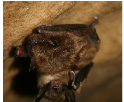
Healthy little brown bats

Email: Purnima.Govindarajulu@gov.bc.ca Phone: 250 387 9755