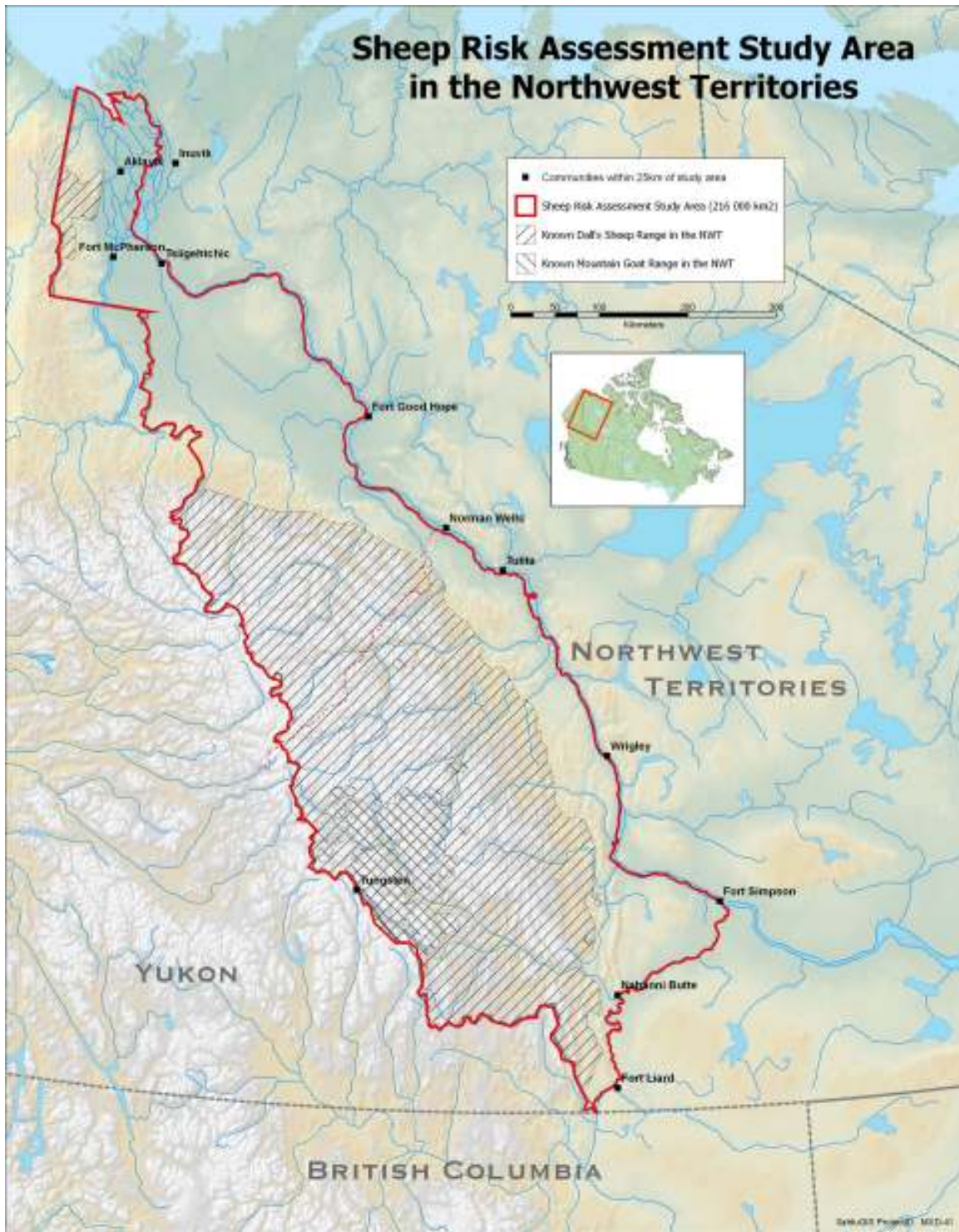
Figure 1. Map showing region of Northwest Territories covered by risk assessment.